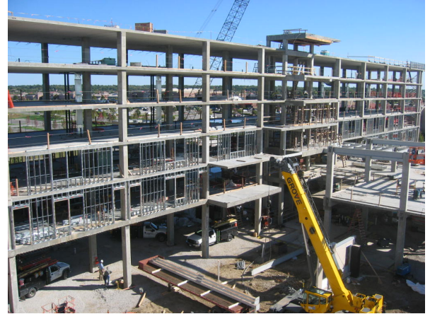
Provided Document and Cost Reviews, and New Construction Monitoring for this new five million dollar hotel, restaurant, and retail space.

Our experience includes over 10 million square feet of Property Condition Assessments and over $800 million in New Construction projects, all over the country. Let us put this experience to work for you.