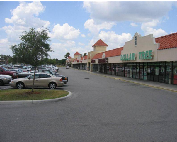
Provided a Property Condition Assessment for this 190,000 square foot retail development.